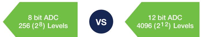
FIGURE 2. Adding just a few bits to the ADC significantly improves the number of voltage levels the ADC can resolve.

This need to address smaller signal details is driving the need to increase the number of ADC bits, while carefully keeping oscilloscope noise low.