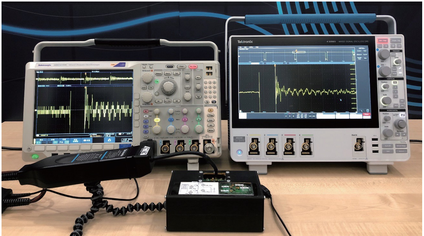
FIGURE 4. Zooming in on a switching signal with an 8-bit MDO4000C (left) and 12-bit 4 Series MSO (right) oscilloscopes

Figure 4 shows the same test using oscilloscopes with different vertical resolutions. The switching circuit rings after each cycle and the goal is to examine the oscillations. To see the entire switching cycle, the vertical scale must be set to around 1 V/div to fit the signal into the 10 divisions of the display.