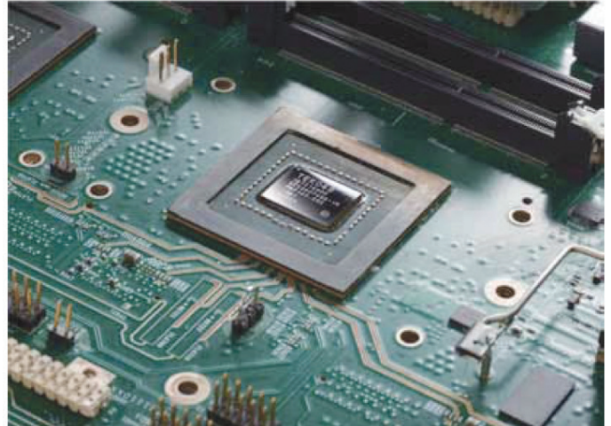
FIGURE 3. The TEK049 ASIC is designed specifically for the latest generation of oscilloscopes

Tektronix' new 4 Series, 5 Series, 6 Series MSO oscilloscopes are equipped with 12-bit ADC technology to help you accurately capture tiny signal details. High resolution is delivered by a custom ASIC called the TEK049, which is shown in Figure 3 and is at the heart of every Tektronix 4, 5 and 6 Series MSO (mixed signal oscilloscope). These scopes support high-definition displays, up to 8 FlexChannel® inputs, 12-bit vertical resolution, and up to 16 bits of resolution with oversampling, all thanks to circuitry integrated into the TEK049. It is a highly-integrated mixed signal system on chip (SOC), with 400 million transistors and 2 billion connections, consisting of four ADCs and signal processing. The ADCs can achieve sample rates up to 25 GS/s.