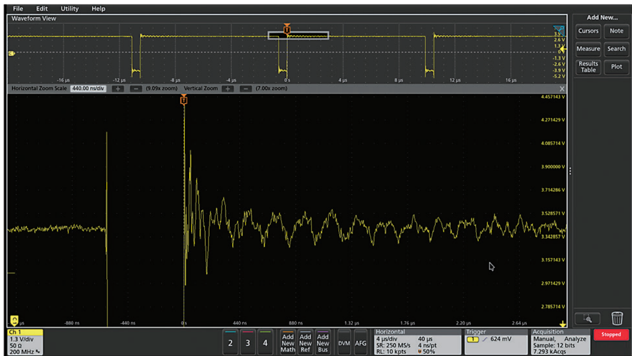
FIGURE 6. Ringing on new 4 Series MSO oscilloscope with 12-bit resolution