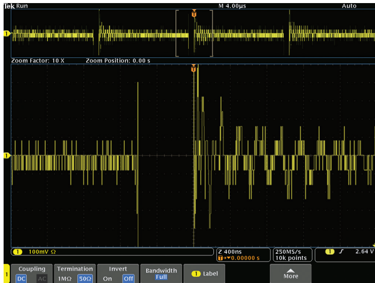
FIGURE 5. Ringing on MDO4000C oscilloscope with 8-bit resolution

For more information on the techniques used to achieve higher-resolution acquisition details download the white paper Achieve Higher Vertical Resolution for More Precise Measurements.